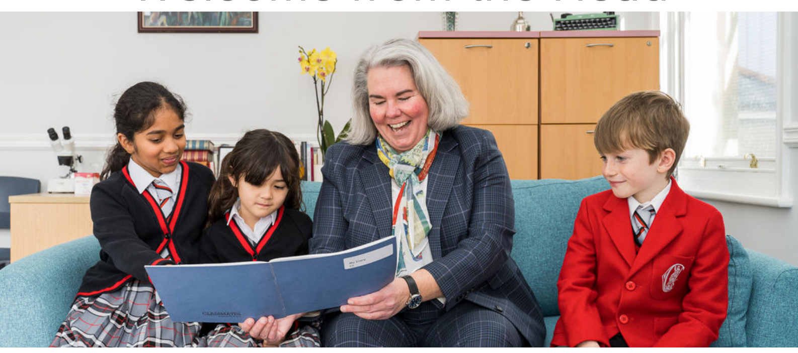
Welcome to St Christopher's! I am delighted that you are interested in joining our wonderful school. I would encourage you to make an application and see for yourself what makes us special. Please read on for a flavour of the type of person we are looking for.

Our staff are positive, caring and ambitious. We strive to: